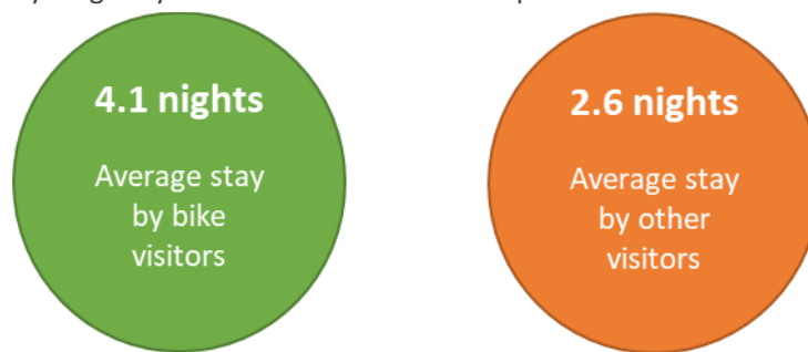
Figure 1 – Average stay length by mountain bike visitors compared to other visitors

Applying this average stay to the estimated 116,366 overnight visitors who mountain bike suggests that these bikers spent a cumulative 481,095 days in Rotorua in 2021. On top of these days in Rotorua by overnighing bikers, there were a further 32,321 days spent by mountain bikers who visit for the day.