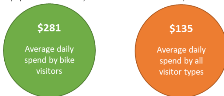
Figure 2 – Average daily spend in Rotorua by mountain bike visitors compared to other visitors

Combining these daily spend estimates with the total days spent in Rotorua by bikers suggests that spending in Rotorua Lakes by visitors who mountain bike totalled $139.8 million in the June 2021 year. Now it wouldn't be fair to causally attribute all this additional visitor spend to Rotorua's mountain bike economy because some mountain bike visitors would have visited anyway had biking not been an option. But even if we only factor in visitors whose main purpose of visiting was to bike 12 , and assume that they wouldn't have come without biking, then that still added $103.4 million to Rotorua's visitor economy 13 .